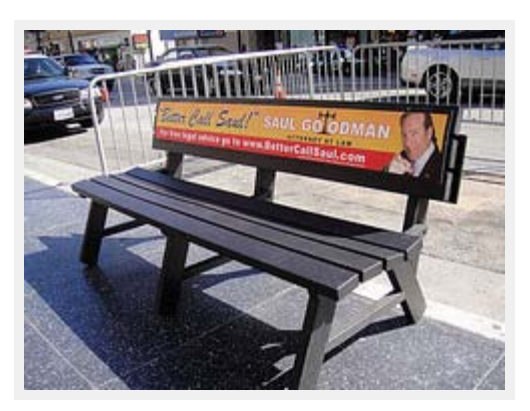
Breaking Bad Screening Lab in Hollywood - Saul Goodman Bench

of a purely personal nature. Examples include divorce or if a family member sues you for slander. But some legal matters of a personal nature can impact business or investment, making some deductible. See <u>Stars and Their Legal Fees: Another Red Carpet?</u>