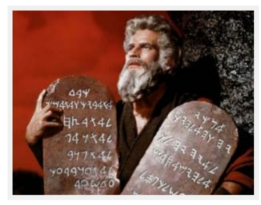
Charlton Heston as Moses in The Ten Commandments (1956)

Gambling winnings? Taxed. You name it, it's taxed. If you find a diamond ring, you pay tax on its fair market value even if you don't sell it. And offsets or deductions are rarely as inclusive as the income.