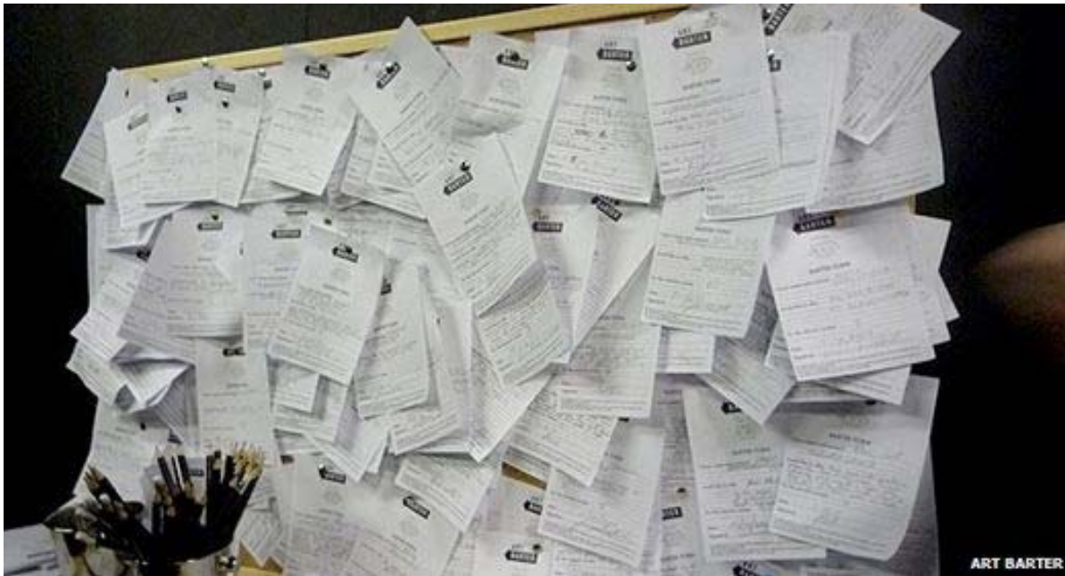
The Art Barter offers board

No cash may change hands - but barter transactions are still potentially taxable.