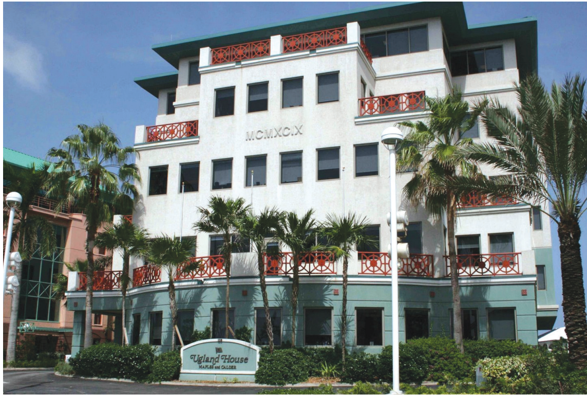
18,857 companies register their address in this small office building in the Cayman Islands.

Small business owners, along with ordinary Americans, pick up the tab either by paying higher taxes, suffering from cuts to public programs, or facing a larger national debt. And without access to offshore subsidiaries, small businesses and medium-sized domestic businesses are put at an unfair competitive disadvantage and forced to compete on an uneven playing field.